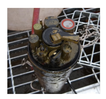
Above: A Proteus withdrawn from a PST tank showing the success of the wiper in maintaining a clear optical window for the TLF sensor!

Right: An example from Severn Trent Water of a Proteus being installed into their existing telemetry system, to provide real-time BOD at one of their WWTWs.