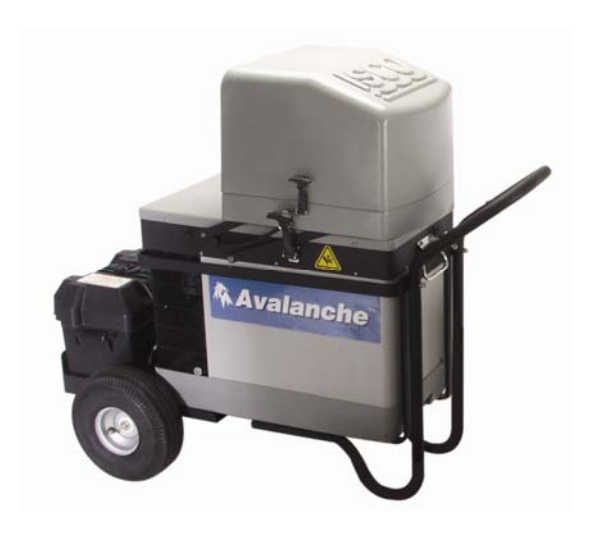
Optional mobility kit includes pneumatic tires for ease of transport over rough terrain, and a convenient battery platform.