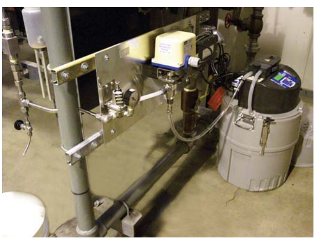
Photo shows purge line lower than desired. Optimum purging occurs when sampler outlet is higher than connection to valve.

The system components come mounted on an aluminum backing plate that also serves as a mounting bracket.